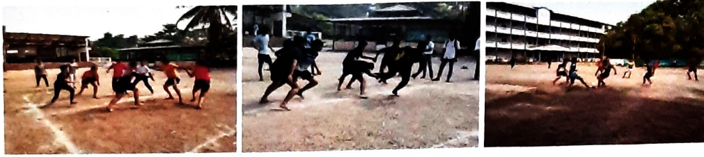
Annual Sports 2022-23