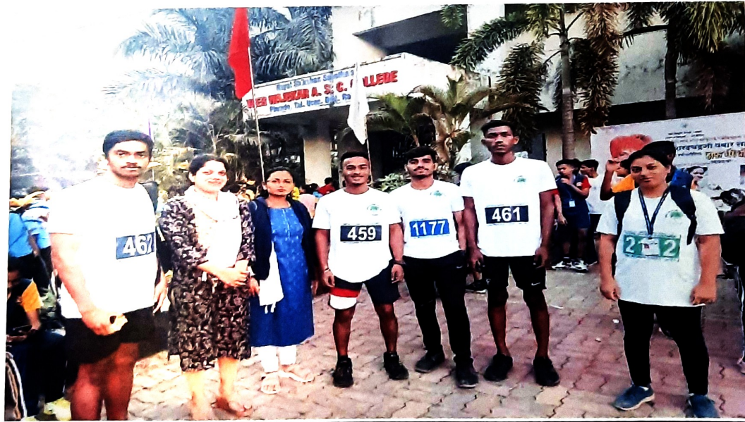
Half Marathon at Phunde