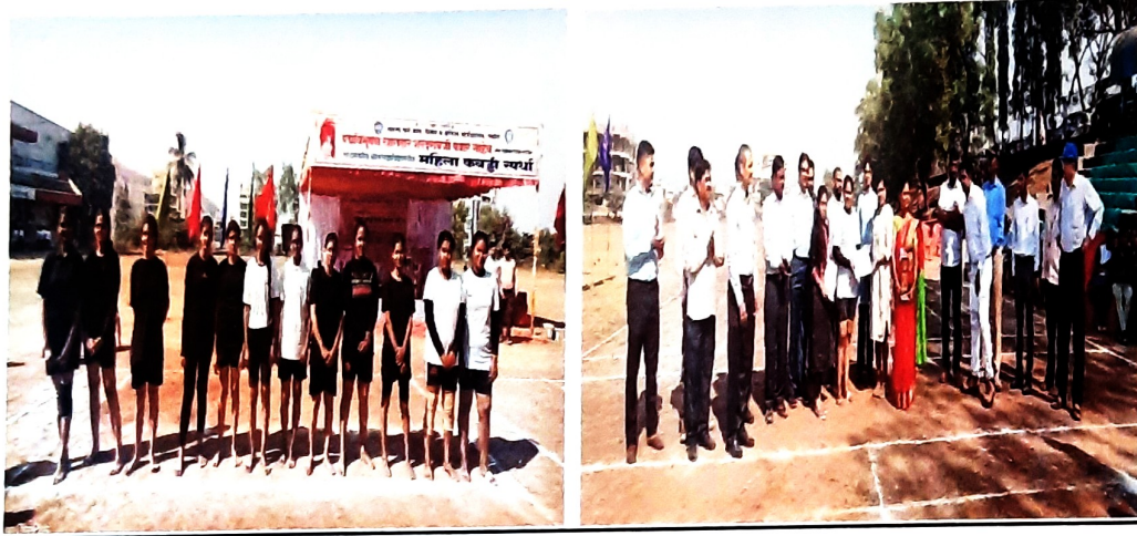
Girl's kabaddi team at Panvel